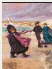
25 Lemordant room presents the reconstitution of the ancient Lemordant's decor for the dining rooms at the Hotel de L'Epée in Quimper, created between 1906 and 1909 by Lemordant