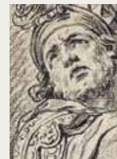
16 Drawings 16 th – 19 th centuries