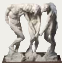
7 Rodin The Three Shadows