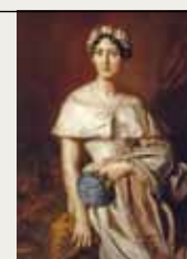
17.18.19 French Paintings of the 19 th century Chassériau, Flandrin, Corot, Boudin, Cottet, Simon...