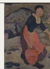
20.21 The Pont Aven School and the Nabis Bernard, Sérusier, Maufra, Gauguin, de Haan, Vallotton, Moret, Denis...