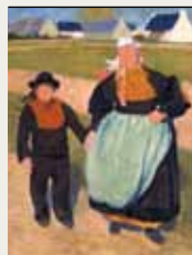
23 Beyond Pont-Aven Delaunay, Gruber, Méheut, Fougeron, Gromaire, Lapicque... Sculptures by Quillivic