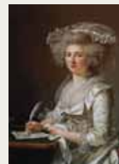
11 ▶ 15 French Paintings from the end of the 17 th to the beginning of the 19 th centuries Mignard, Boucher, Fragonard, Meynier, Labille-Guiard, Robert, Valenciennes...