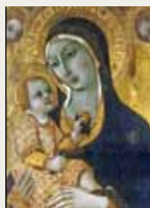
8.9.10 Italian Paintings from the end of the 14 th to the 18 th centuries Bartolo di Fredi, Dell'Abate, Reni, Solimena, Sano di Pietro...